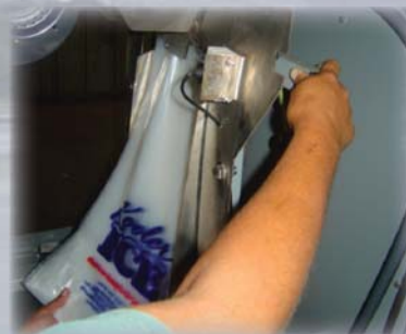
Easy Bag replacement

The unit is designed to be used and maintained by anyone, regardless of their technical ability. The Kooler Ice machine is "smart" and will track sales automatically and notify the user if it is out of ice or bags. The machine holds 250 bags at a time and they can be easily replaced in less than two minutes.